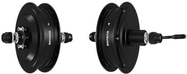
Figure 1-1 Motor Appearance

This Rear-drive motor is compatible with a Disc-brake and has a rated power of 250W. This motor is suitable for trekking bikes and mountain bikes.